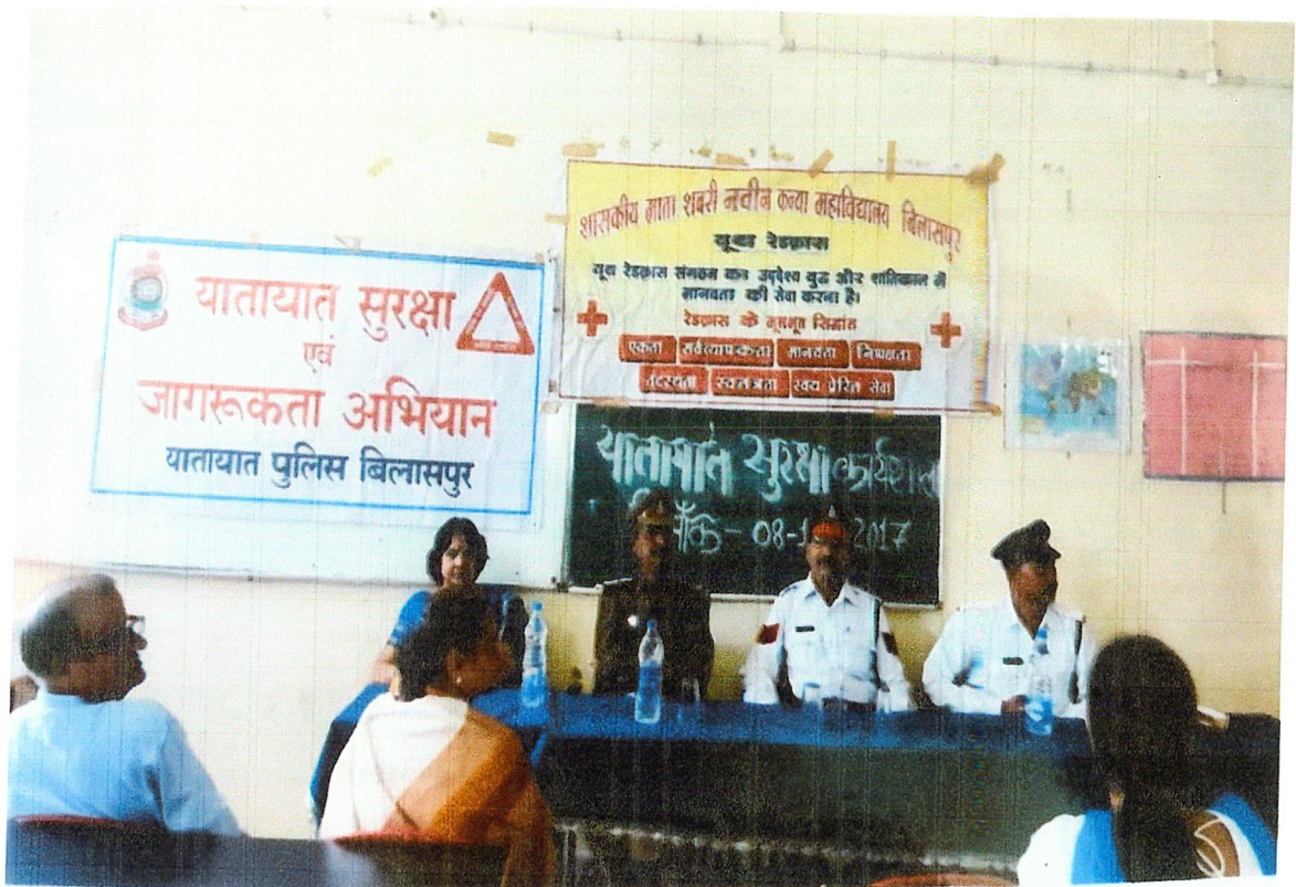
"यातायात सुरक्षा - अत्याह"