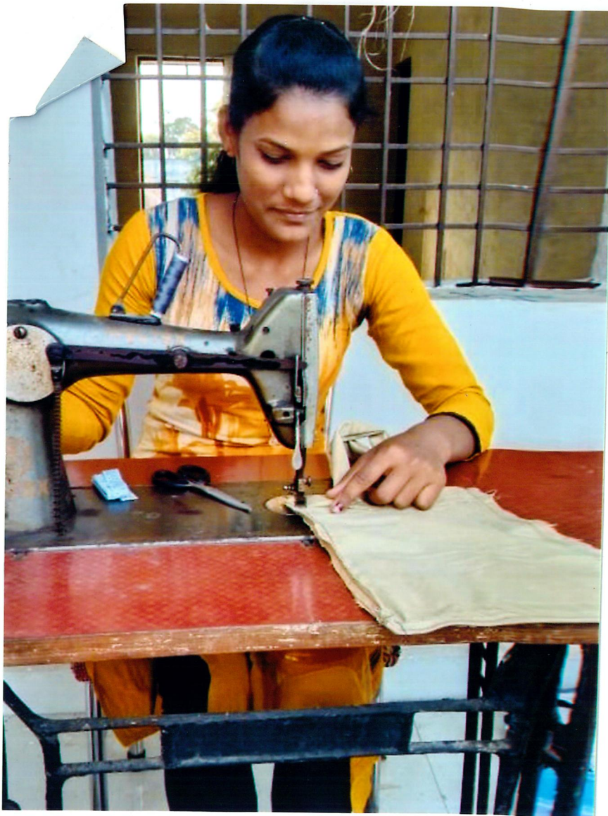
Cloth bags Making by 8 student's