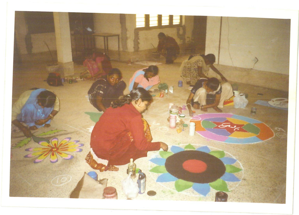
Students Participation in Rangoli Competition