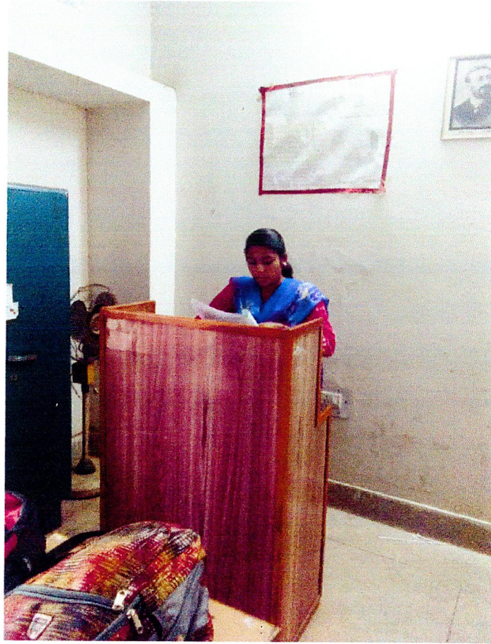
Seminar Presentation Class level