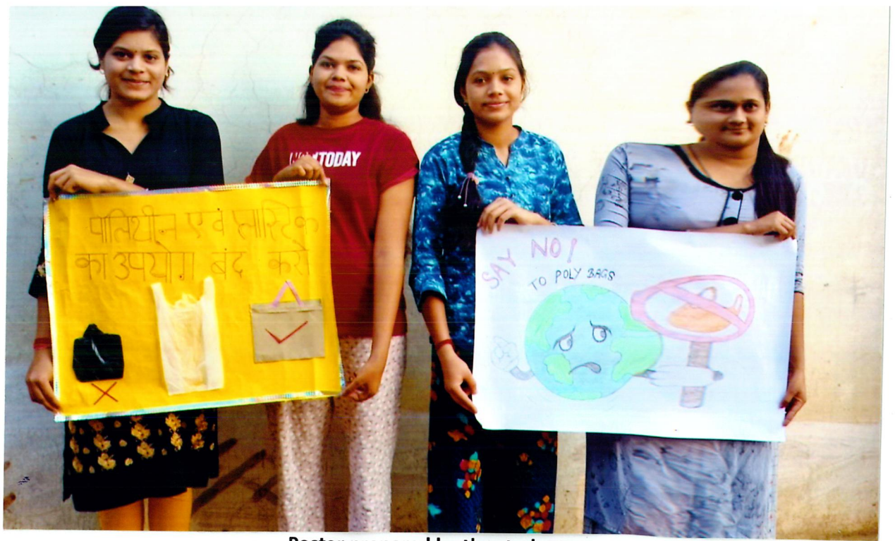
Poster prepared by the student