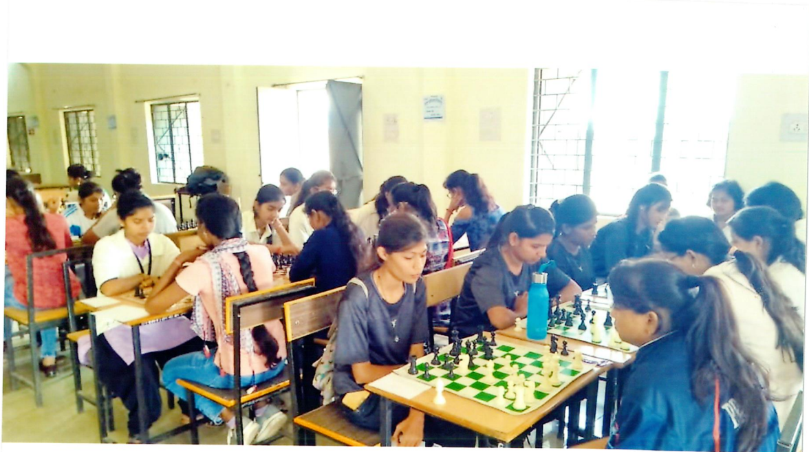
Participation of Student in Indore Games