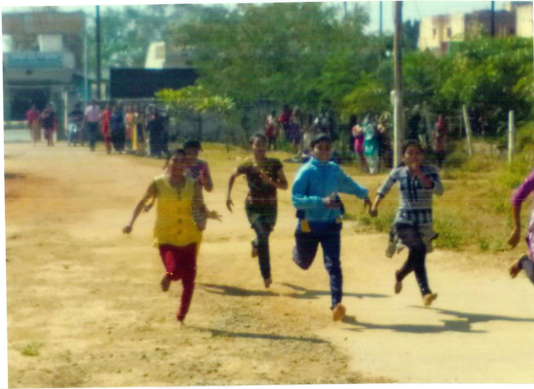
Participation of Students in Sports