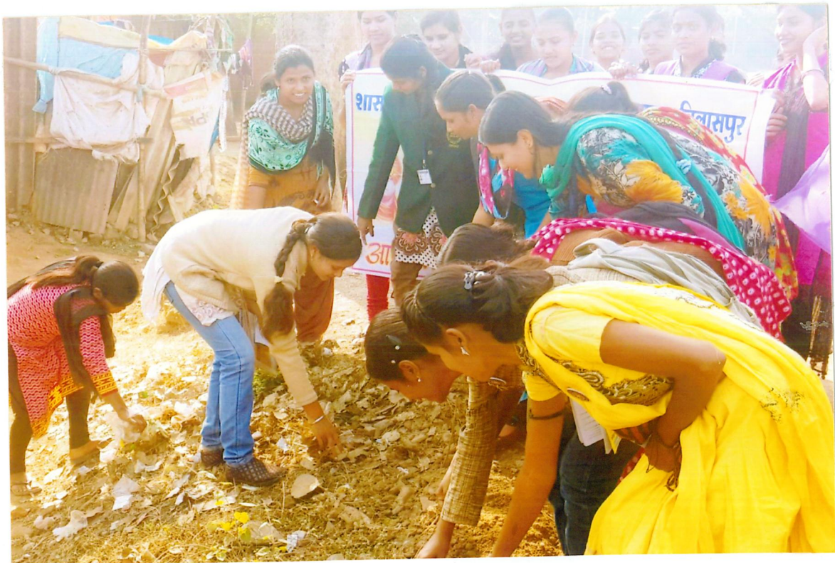
Swaccha Bharat Abhiyan

Students participation in co-curricular activities which support Teaching Learning process and improved academic performance of the students. Co-Curricular activities help students to develop problem solving, reasoning, critical thinking, communication and collaborative abilities.