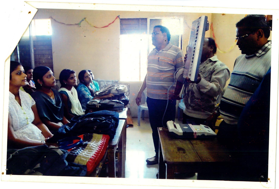
Students gain knowledge about electronic voting machine